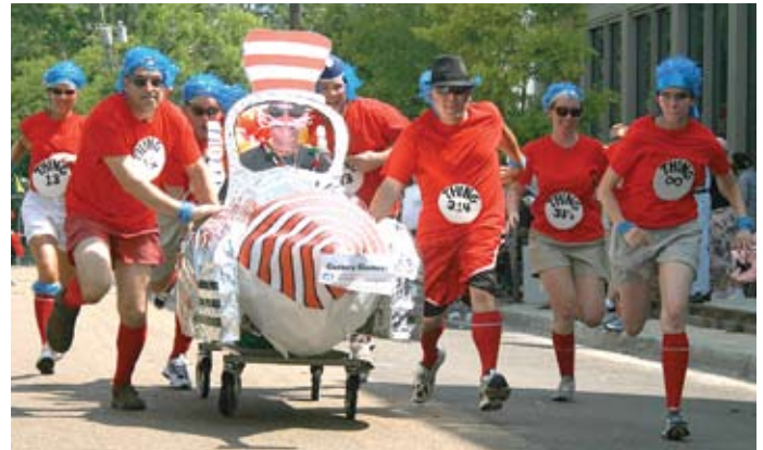
GURNEY GAMES Members of event Title Sponsor's team, Fauntleroy & Latham Architects, race their "Dr. Seuss is Loose" gurney down Columbia Street. These "Things" secured an exciting 2nd Place win in the Dynamic Décor category.