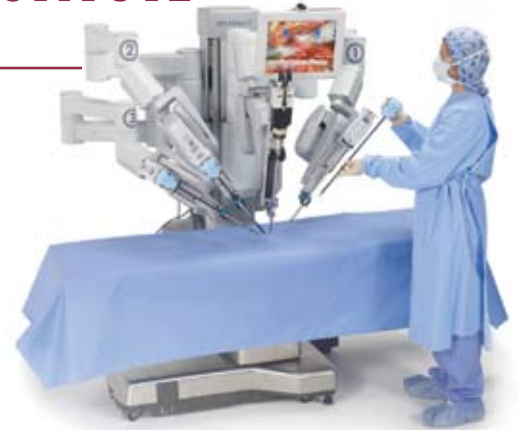
Da Vinci robotic surgery enables physicians to perform complex surgeries with minimal incisions.