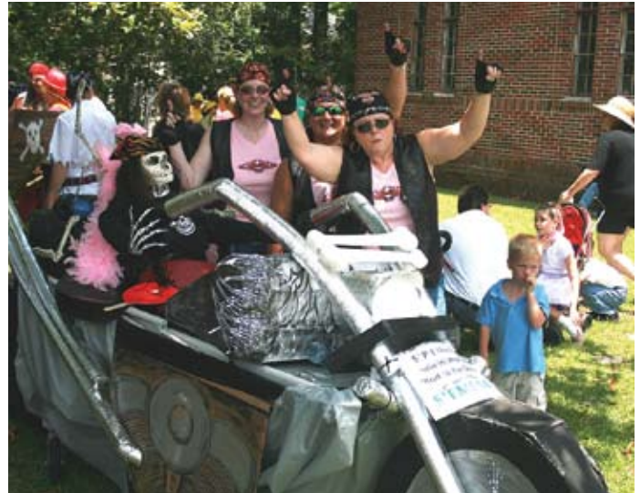
GURNEY GAMES Members of STPH Nursing Administration celebrate a 1st Place victory in the Dynamic Décor category for their "Bad to the Bone" gurney, sponsored by Siemens Medical Supply.